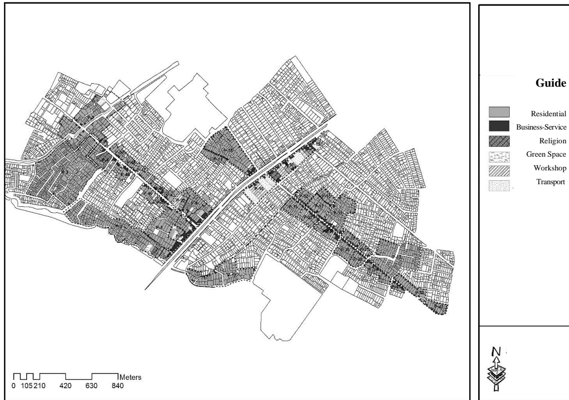
Map 2- the position of land use in extremely distressed blocks needing urban regeneration