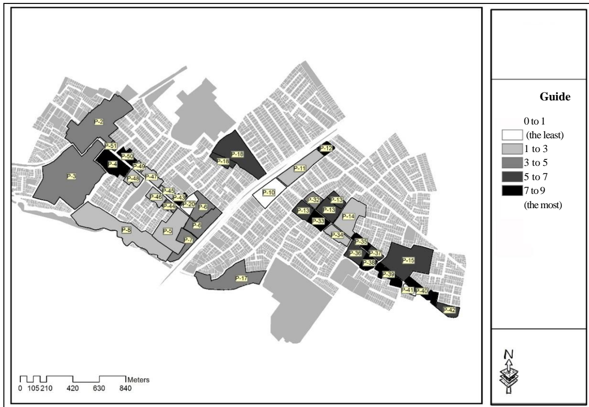
Map 3- Information layer of social capital around the projects from the least to the most

assessment matrix of layers' combination entered to it. Map 3 shows a sample of formed information layers (residents' social capital) in GIS software.