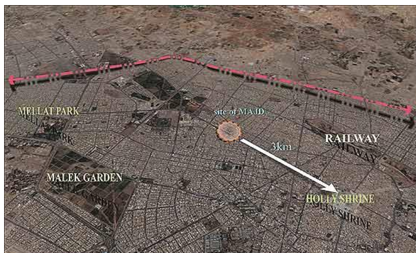
Map1. Location of studied area in the holy city of Mashhad and municipality 2

It is noteworthy that despite the data of transactional value of real estate and its function in much analysis of urban economics and housing economy, no continuous monitor and record have been done by the municipality so far, and access to these kinds of data is possible