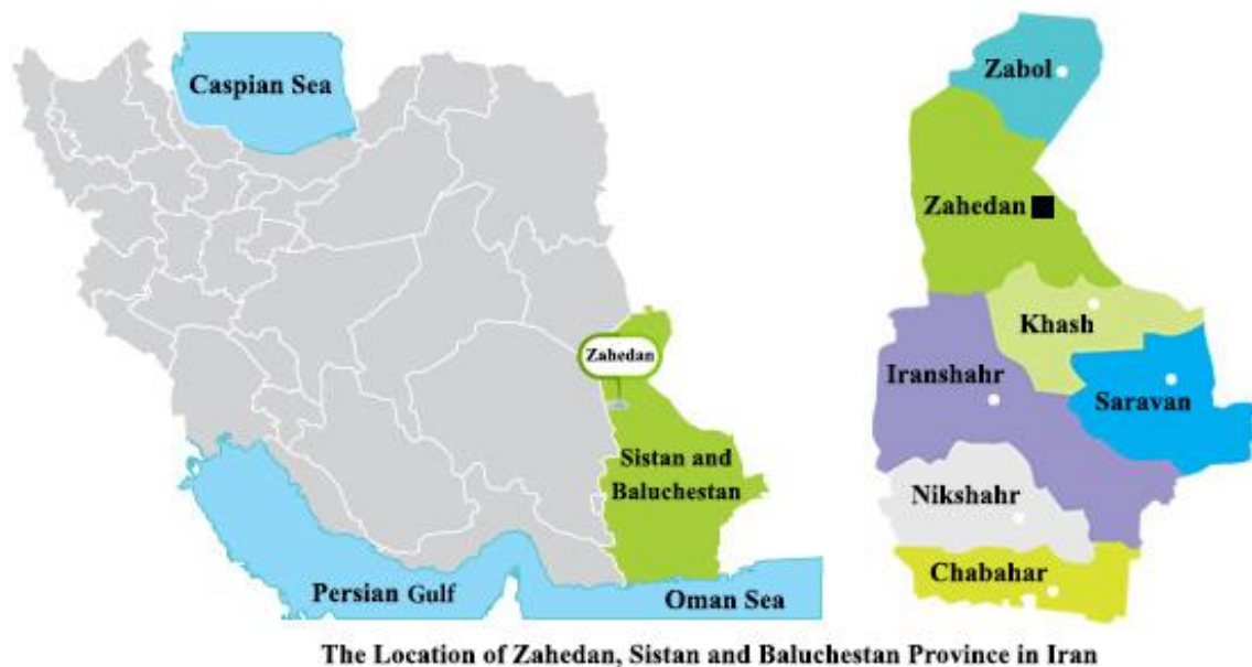
Map1. The location of Zahedan, Sistan and Balouchestan Province, Iran